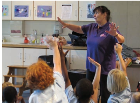
Hundreds of young people across the state enjoy participating in a variety of activities during hands-on workshops led by Ohio Chautauqua scholars.