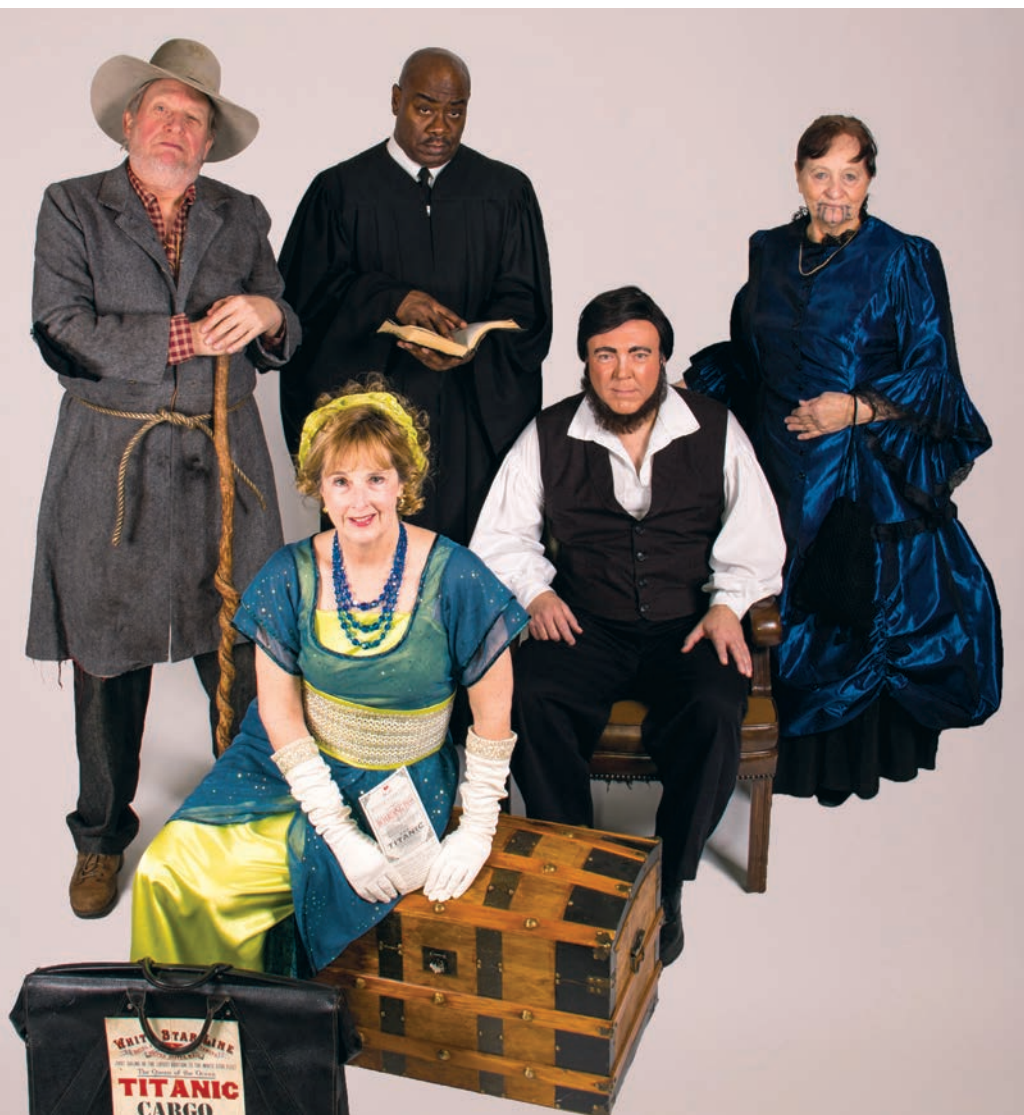
Journey Stories Troupe