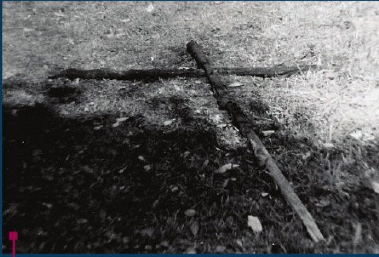
Meant to intimidate the marchers, unknown individuals burned a cross on Walnut Street, along the route walked every day by the black families protesting Hillsboro's school segregation.

benefited from new books, playgrounds and a selection of musical instruments and art supplies.